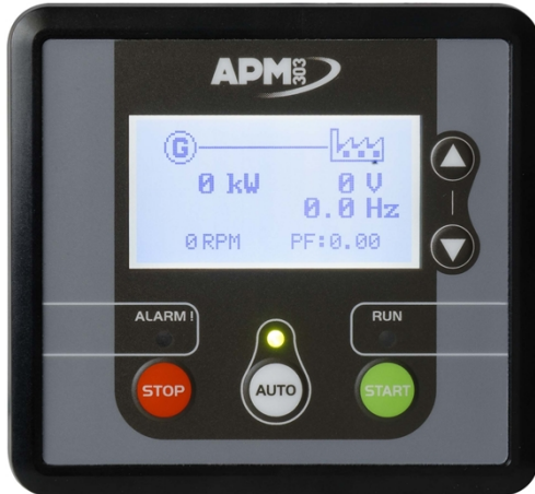
APM303, comprehensive and simple

The APM303 is a versatile unit which can be operated in manual or automatic mode. It offers the following features: Measurements: phase-to-neutral and phase-to-phase voltages, fuel level (In option : active power currents, effective power, power factors, Kw/h energy meter, oil pressure and coolant temperature levels) Supervision: Modbus RTU communication on RS485 Reports: (In option : 2 configurable reports) Safety features: Overspeed, oil pressure, coolant temperatures, minimum and maximum voltage, minimum and maximum frequency (Maximum active power P<66kVA) Traceability: Stack of 12 stored events For further information, please refer to the data sheet for the APM303.