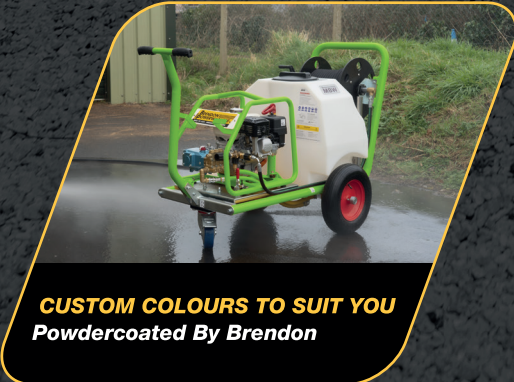
CUSTOM COLOURS TO SUIT YOU Powdercoated By Brendon