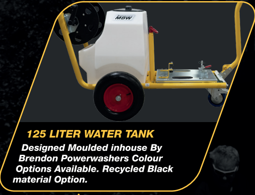
125 LITER WATER TANK Designed Moulded inhouse By Brendon Powerwashers Colour Options Available. Recycled Black material Option.