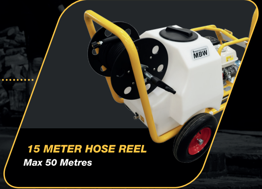
15 METER HOSE REEL Max 50 Metres