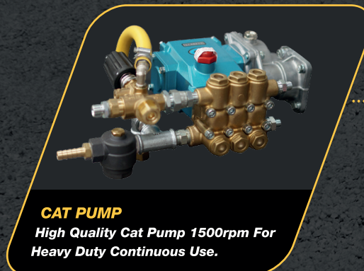
CAT PUMP High Quality Cat Pump 1500rpm For Heavy Duty Continuous Use.