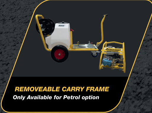
REMOVEABLE CARRY FRAME Only Available for Petrol option