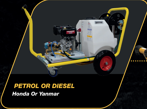
PETROL OR DIESEL Honda Or Yanmar