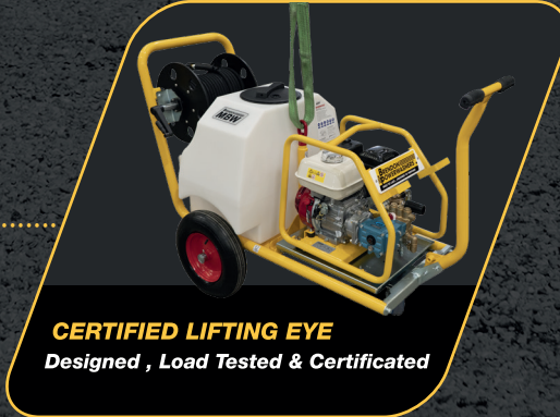
CERTIFIED LIFTING EYE Designed , Load Tested & Certificated